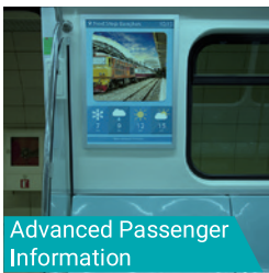
Advanced Passenger Information